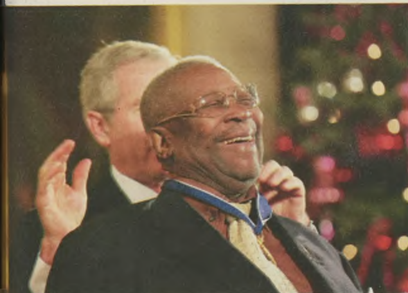
B.B. King breaks out in laughter as he's presented with the Presidential Medal of Freedom Friday, Dec. 15, 2006, by President George W. Bush in the East Room of the White House. Introducing the musician, President Bush told the audience, when speaking of the blues, "two names are paramount... B.B. King, and his guitar, Lucille. America loves the music of B.B. King, and America loves the man, himself."

North Carolina Central University prepares students to succeed in the global marketplace. Flagship programs include science, technology, engineering, and math (STEM) disciplines, nursing, education, law, business and the arts. Founded in 1910 as a liberal arts college for African-Americans, NCCU remains committed to diversity in higher education. Our alumni are among the nation's most successful scientists, researchers, educators, attorneys, artists and entrepreneurs. Visit www.nccu.edu .