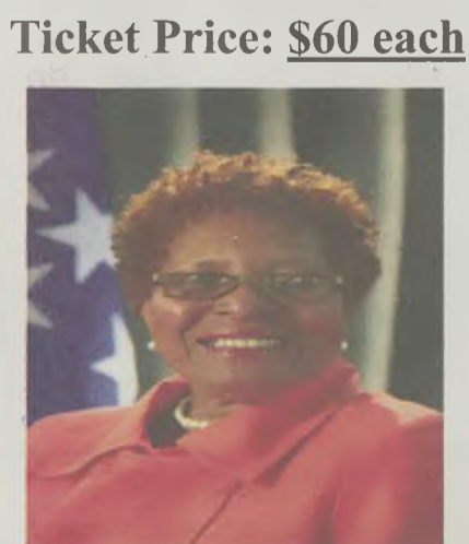
Emcee: Cora Cole-McFadden

Durham City Council Member - Ward 1/Mayor Pro Tempore - City of Durham