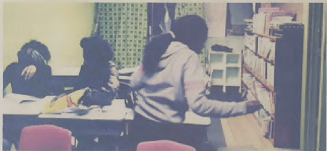
Student at Saint Sya