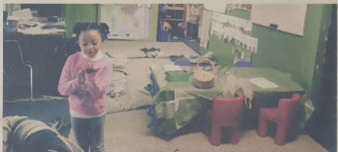
Student at Saint Sya