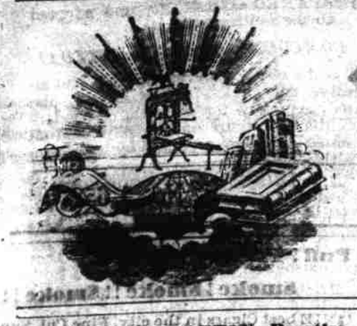
JONES & PENDLETON, Proprietors. Friday, July 3, 1874.

Free from the following scriptures that letter our free-born reason.