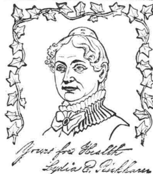
Lydia E. Pinkham's Vegetable Compound.