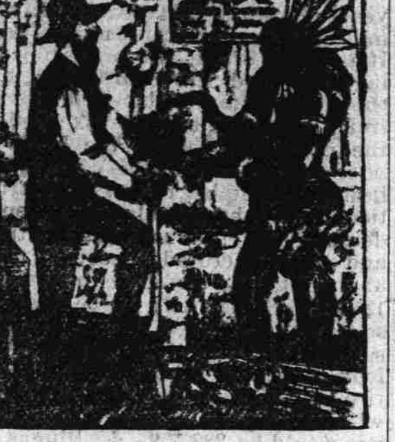
Who first issued in Commercial Form the great and purely Vegetable Blood Remedy from Southern Forests.