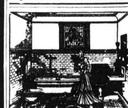
It is a nice bath room you want, we can install same promptly; this is the place for quick service always.