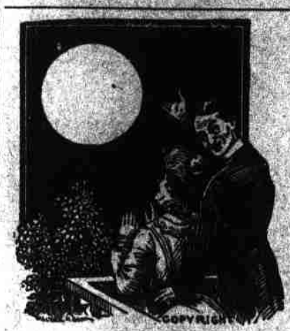
THE MOON IS MADE OF GREEN CHEESA

many people would lead her to bemany people would lead her to be-lieve, when the housewife goes to purchase flour for her baking day— but if she has once used the Pride of Charlotte flour she will take nothing else. It is made of the choicest selected wheat and ground at our