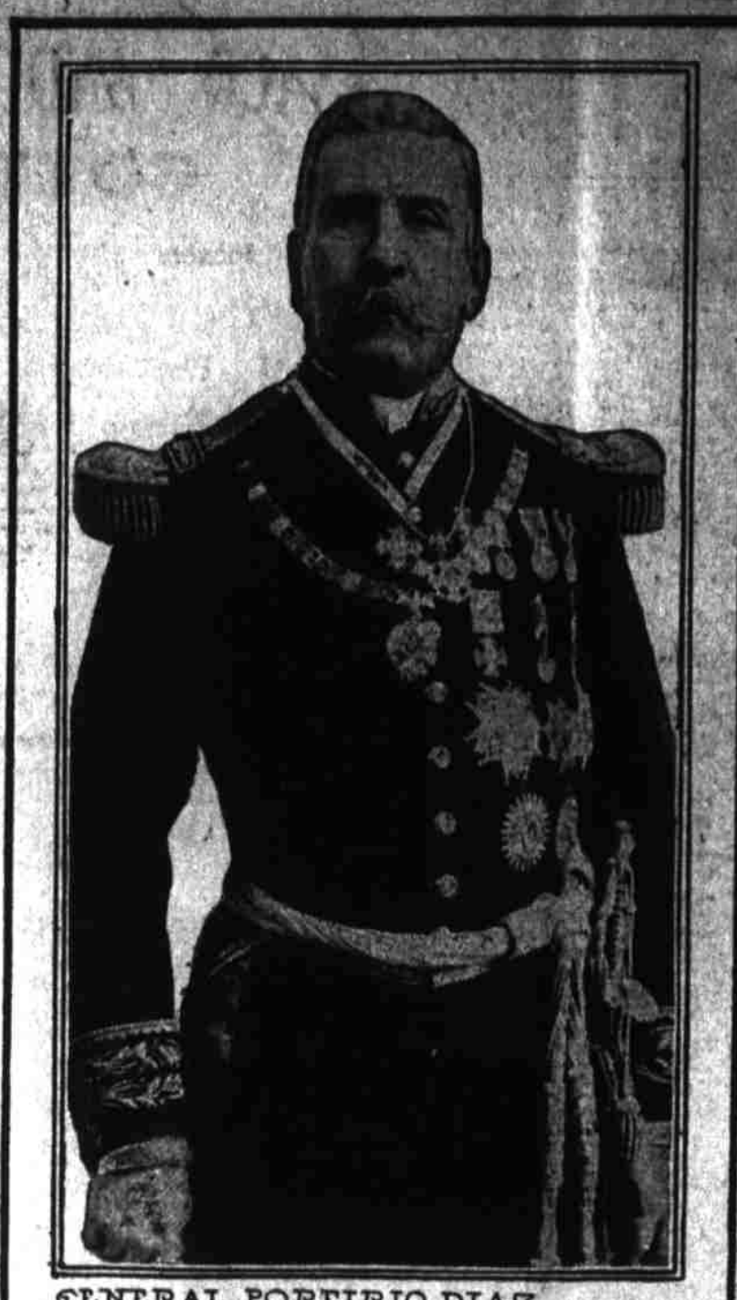
GENERAL PORFIRIO DIAZ

Special to The Observer. Salisbury, Sept. 28.—The Presbyterians, who have been here two days and three nights attending Concord Presbytery, adjourned last night to meet in semi-annual conference at Hickory.