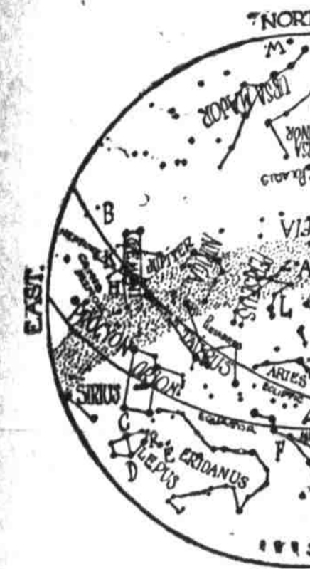
Fig. 1.—The constellations at 9 p. m., December 1.

of the enmity of these two creatures. In a similar way just as Lepus sets the group known as the Crow rises and from this the ancient belief that the Hare detected the voice of the Raven is believed to have been derived.