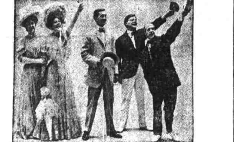
"Goodbye Father," Scene From "The College Widow," Academy, March 1st.