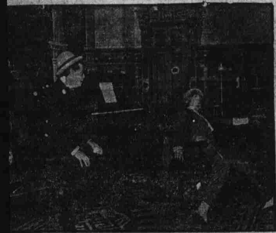
Scene From "What Happened to Jones."