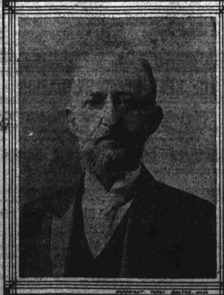
Oscar S. Straus.

No woman who uses "Mother's Friend" need fear the suffering and danger incident to birth; for it robs the ordeal of its horror and insures safety to life of mother and child, and leaves her in a condition more favorable to speedy recovery. The child is also healthy, strong and good natured. Our book "Motherhood," is worth its weight in gold to every woman, and will be sent free in plain envelope by addressing application to Bradford Regulator Co., Atlanta, Ga.