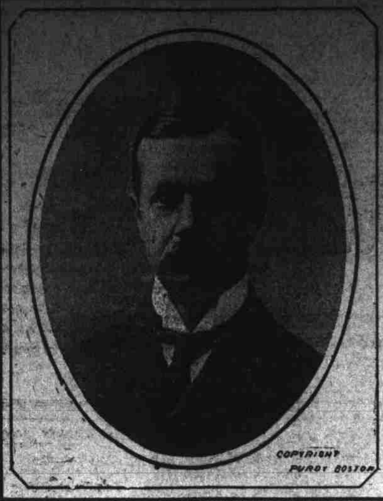
George von L Meyer.