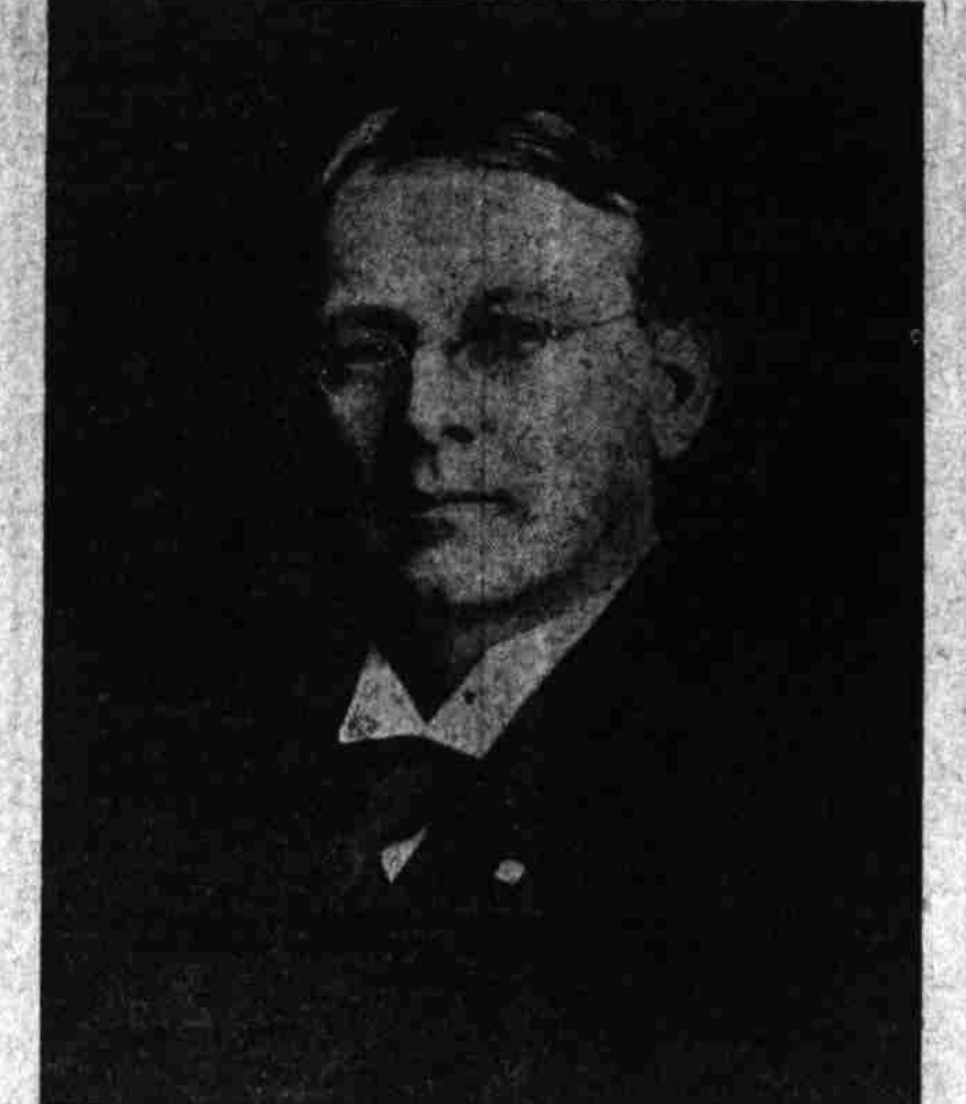
State Treasurer B. K. Lacy, who was re-nominated by the State convention yesterday.

PEPSI-COLA is the Original Pure Food Drink—guaranteed under the U. S. Gov't Serial No. 3813. At all soda fountains, 5c a glass—at your grocer's, 5c a bottle. Beware of imitations.