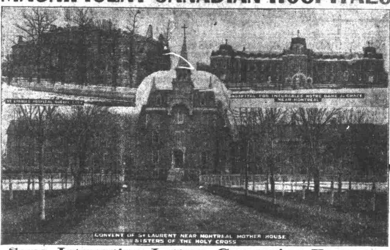
Some Interesting Letters Concerning Peru-na.