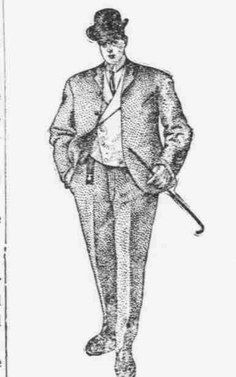
A $15.00 Suit of Clothes to the Burke County Farmer Making the Second Largest Yield of Corn on One Acre.