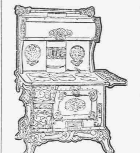
First Prize—A Burkemont Steel Range Cook Stove—to the Burke County Farmer Raising the Most Corn on One Acre.