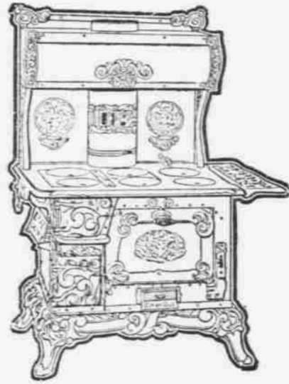
First Prize—A Burkemont Steel Range Cook Stove—to the Burke County Farmer Raising the Most Corn on One Acre.