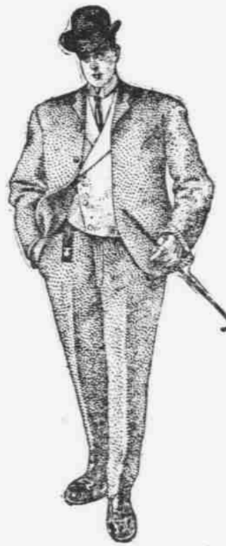
A $15.00 Suit of Clothes to the Burke County Farmer Making the Second Largest Yield of Corn on One Acre.