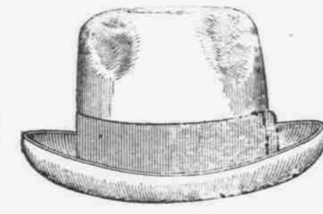
The Best Hat in Morganton to the Farmer Making the Third Largest Yield of Corn on One Acre.