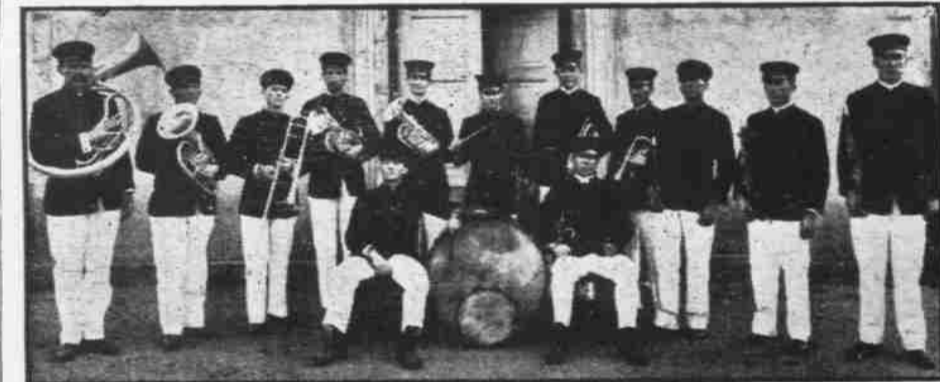
THE MORGANTON CORNET BAND. The boys have nice new uniforms and make a fine appearance, and not only that, after hard work during the past winter they now make excellent music.