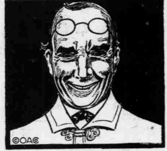
Whose Careful Druggist Am I?

How Diphtheria is Contracted. One often hears the expression, "My child caught a severe cold which developed into diphtheria," when the truth was that the cold had simply left the little one particularly susceptible to the wandering diphtheria germ. If your child has a cold when diphtheria is prevalent you should take him out of school and keep him off the street until fully recovered, as there is a hundred-times more danger of his taking diphtheria when he has a cold. When Chamberlain's Cough Remedy is given it quickly cures the cold and lessens the danger of diphtheria or any other germ disease being contracted.