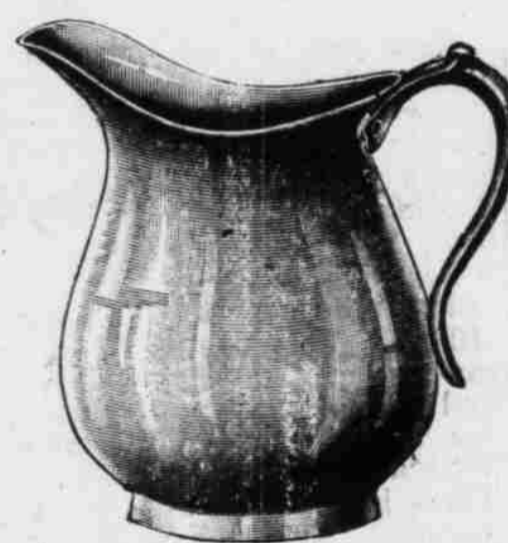
2 3-4 qt. Milk Pitcher $1.98 Each

Add little tragedies of real life: they are already beginning to run the 1924 gubernatorial race!—Greensboro News.