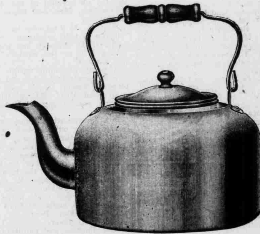
6 qt. Tea Kettle Only $1.98 Each