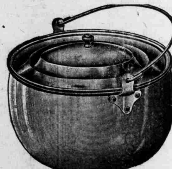
8 qt. Covered Kettle Only $1.98 Each

The Factory Man will be here to hold this Sale and will Start Saturday, July 16th., at 10:30 A. M.