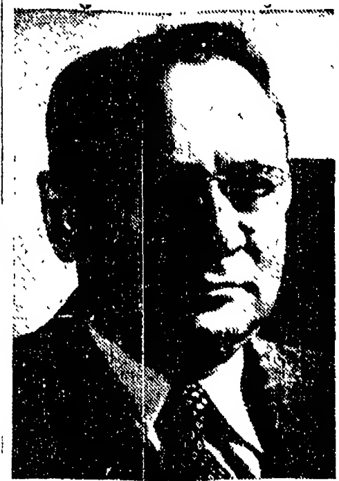
MEDAL WINNER... Vladimir K. Zwoyrtin, New York electronic research director, who has been announced as winner of the Howard N. Potts medal of the Franklin Institute.

ATHLETES FOOT ITCH NOT HARD TO KILL. IN ONE HOUR. If not pleased, your 35c back at any drug store. PEN-OL, a STRONG fungicide, contains 80% alcohol. IT PENETRATES. Reaches MORE germs to KILL the itch. Today at Kelly's Drug Store