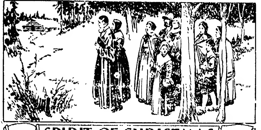
SPIRIT OF CHRISTMAS