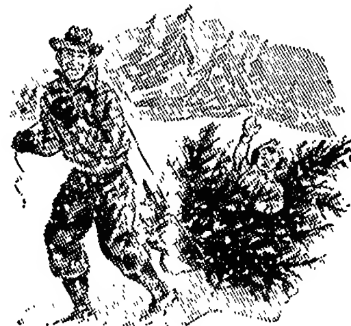
A MERRY CHRISTMAS TO EVERYONE!

Field workers reported that 47 of the state's 100 counties now have county chairmen and that most of the others will have leaders for the drive named within a few days.