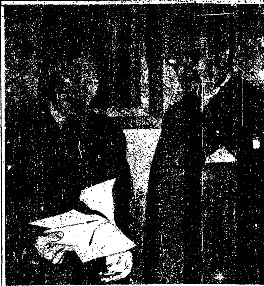
EISENHOWER CONFERS . . . General Dwight D. Eisenhower (left), commander-in-chief of the Atlantic pact forces, holds his first official conference with the United States director of defense mobilization, Charles Wilson, at the general's temporary SHAPE headquarters in Paris. Among the topics discussed by the two officials was the matter of the division of resources among the Atlantic pact members.

Lying lips are an abomination unto the Lord; but they that deal truly are his delight. In the way of righteousness is life; and in the path thereof is no death (Prov. 12:19-20-22-23). Jesus is the way, the truth, the life, and when He comes into our heart a great change takes place. It is wonderful to be so yielded to him that the very words of our mouths glorify Him. The truth makes us free. We should cry with the Psalmist, "Search me, O God, and know my thoughts; and see if there be any wicked way in me, and lead me in the way everlasting (Ps. 139:23-24). We need to have our hearts searched daily, and put away all that is displeasing to God. Often we bring shame to the name of Christ, because we fail to take Him at His word, and depend upon Him, and trust Him. May we as God's children seek to please Him each moment of each day of each year that He permits us to live. May we put self aside, regardless of what comes, and let Christ reign in our hearts and lives. Often we are tempted to look at others when we should be looking unto Jesus. As God searches our hearts may we let Him cleanse us and make us a fit place for Him to live on earth. May we have faith and confidence in God that He never fails. If we can believe this to be a fact we shall be established, steadfast, unmovable, always abounding in the work of the Lord.