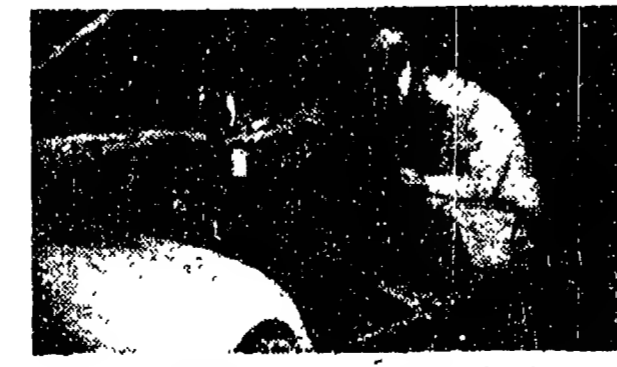
Shaw inspects FirePower, the greatest new engine in 27 years.