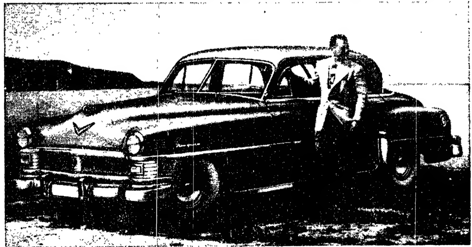
Wilbur Shaw thinks so much of this new Chrysler, he has selected it as Pace Car for the 1951 Indianapolis 500-mile race.