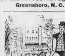
Trade supplied by L. Richardson Drug Co. Greensboro, N. C.