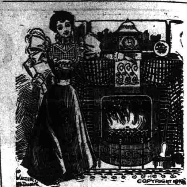
FOOD FOR THOUGHT.

Why does the coal shipped by us always burn clear and free, give out more heat, burn longer and need replenishing less often than any other coal you can buy? We won't charge you anything for telling you that it is because it is care ully selected, high-grade and carefully screened. and we don't ask any more for it than you will pay for some inferior grades.