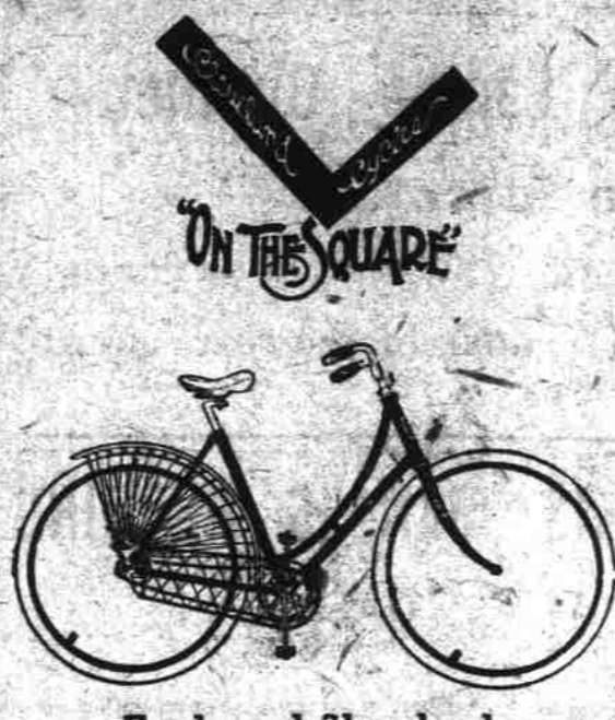
Eagle and Cleveland.