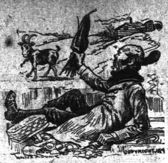
Talking through his hat.

CAROLINA COAL CO. 23 Patton Ave. Phone 130.