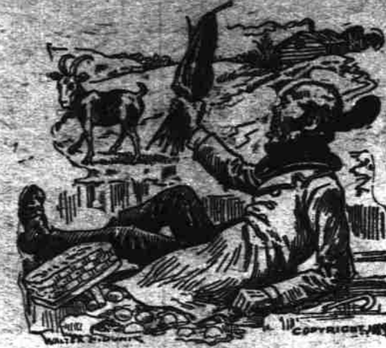
Talking through his hat.

the man is who tells you that he can rival our laundry work in beauty or general satisfaction to the wearer. We keep on top in up to date laundry methods and we take special pains to please each individual patron in the exquisite finish and general renovation of their linen. Care in handling is our watchword.