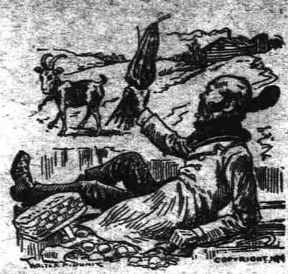
Talking through his hat.

the man is who tells you that he can rival our laundry work in beauty or general satisfaction to the wearer. We keep on top in up to date laundry methods and we take special pains to please each individual patron in the exquisite finish and general renovation of their linen. Care in handling is our watchword.