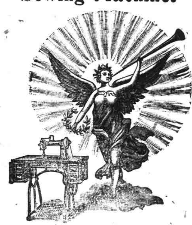
Rotary Motion and Ball Bearings.