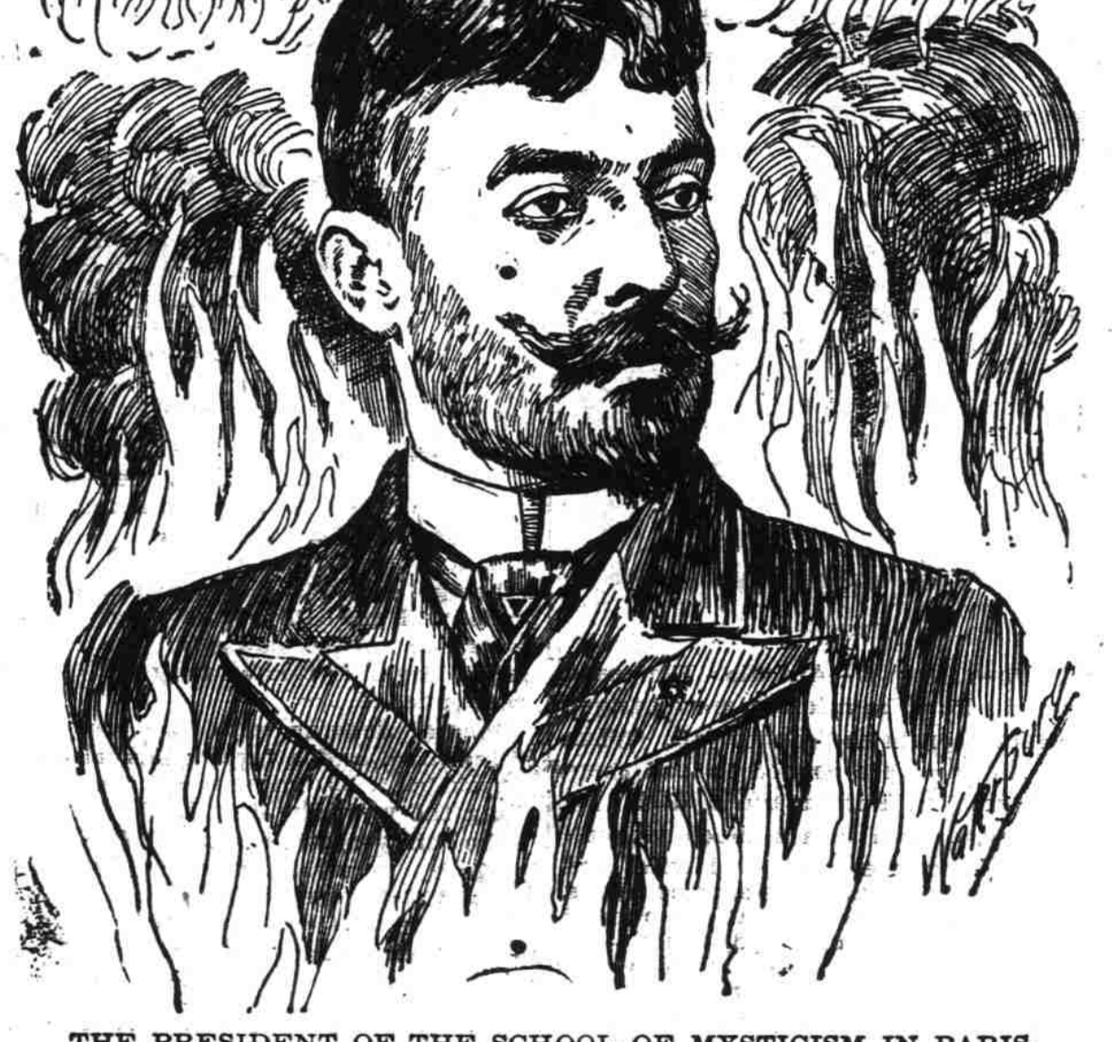
THE PRESIDENT OF THE SCHOOL OF MYSTICISM IN PARIS.

THE INITIATED, IN VIRTUE OF THE POWERS TRANSMITTED THEM BY THE MASTERS, REIGN IN HEAVEN, COMMAND ON EARTH AND ARE FEARFUL IN HADES"