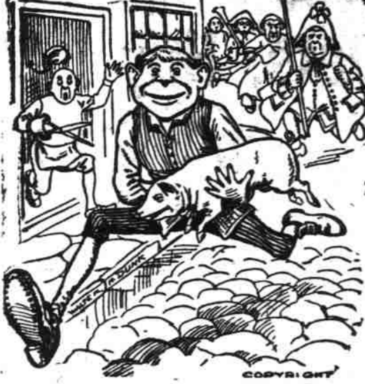
Tom, Tom, the Piper's Son,

stole a pig and away he run. Tom probably yielded to an uncontrollable desire for a taste of fine pork.