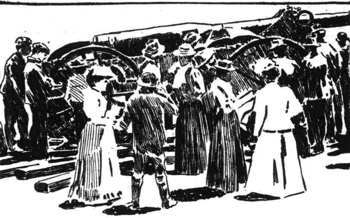
INSPECTING ONE OF THE BIG GUNS BEFORE IT IS SHIPPED TO SOUTH AFRICA.

For the cure of all blood diseases and Spring Humors, Hood's Sarsaparilla is unequalled. Try it.