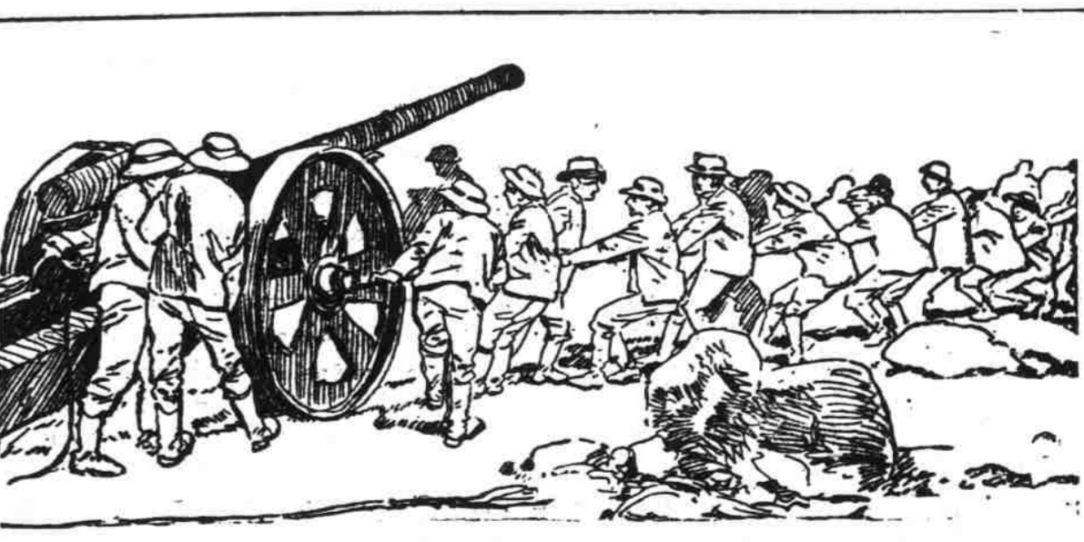
THIS BIG GUN HAS BEEN DRAGGED FROM LADYSMITH TO THE HILLS THAT GUARD THE TUGELA.

Squirrels and Turkey Calls. Did it ever occur to you to use a turkey call in squirrel hunting? I once had three gray squirrels up a large gum tree and had tried to slip up to them, but they saw me and hid. I went up as close to the tree as I wanted and sat down to wait for them to come out. I sat there 20 or 30 minutes, and they did not move that I could see. I was in a fairly good turkey country and so got out my turkey call and made a few calls, and in less than two minutes all three squirrels were in sight, and in a good deal less time they were all mine on the ground. I take it that they thought that if it was safe for a turkey to be calling they were in no danger. I would like to know if any one else ever had a like experience, and if I ever get in a like situation I will make experiments until I am satisfied.—Forest and Stream.