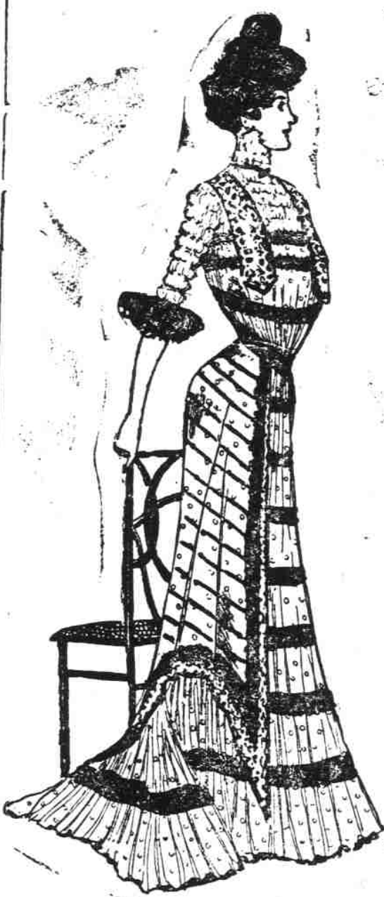
FOR THE PRESIDENT'S NIECE.