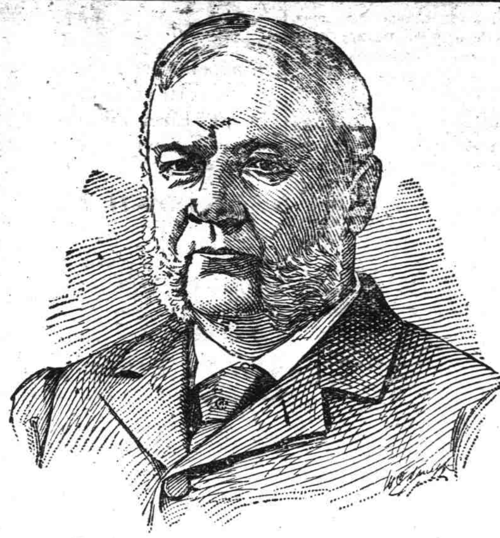
CORNELIUS N. BLISS.