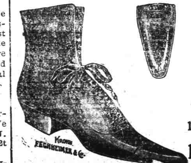
Krohn, Fehheimer &

P. S. During this sale no goods sent out on approval.