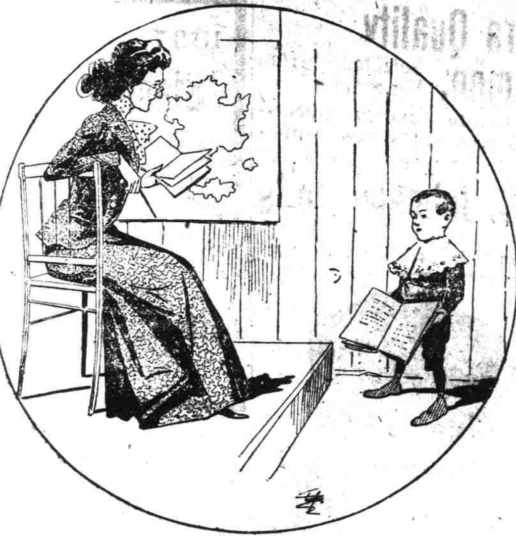
RIGHT. Teacher—"What is the principal product of Ireland?" "Policemen."