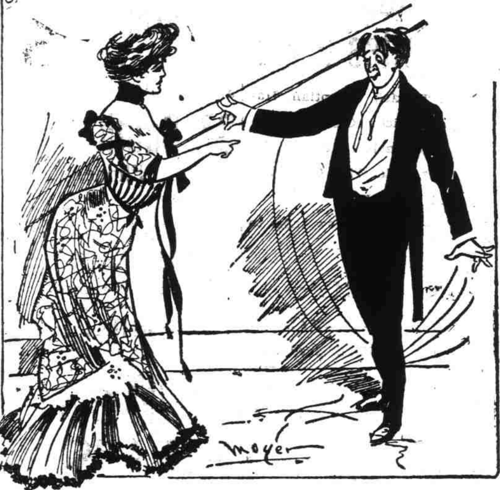
Maude—George, dear, I have found out something dreadful about you—and will tell you—if you promise faithfully not to breathe it. George—Adored one, my lips will be sealed. Maude—Well, it is just this—you've been drinking.