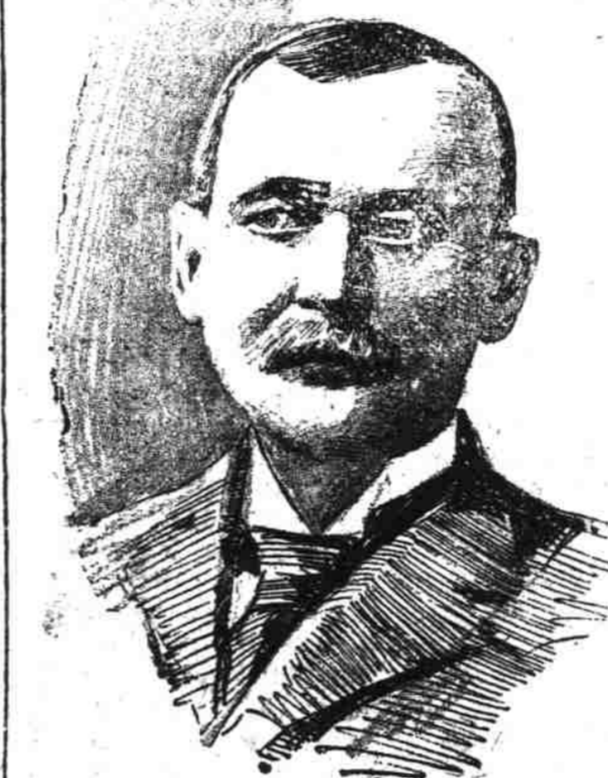
REAR ADMIRAL HIGGINSON, in charge of the "White Squadron," to whom Commander Pillsbury, surrendered the "Blue Squadron," Sunday morning.

New York, Aug. 25.—In accordance with the wishes of the war department, General MacArthur today gave out for publication the full scope and purpose of the manoeuvres of the army