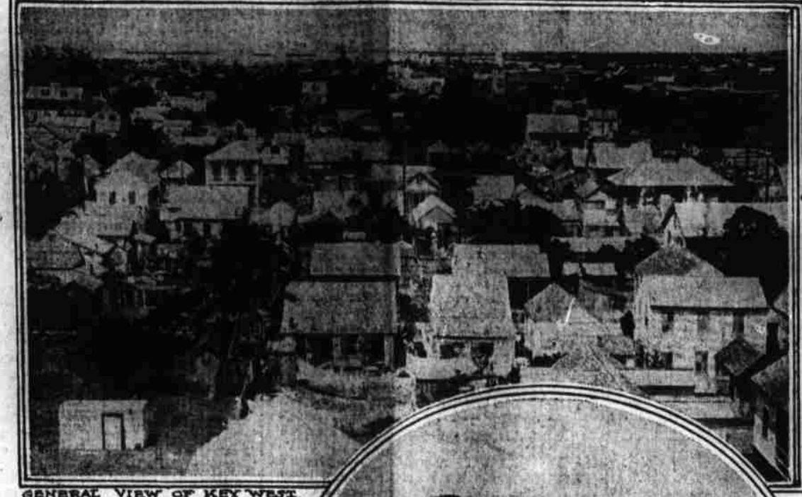
GENERAL VIEW OF KEY WEST.

President Diaz Arrives. The arrival of President Diaz on this side was signalled by a salute of twenty-one guns. Assisting in the reception of the Mexican executive were Secretaries Dickinson and Nagel, Postmaster General Hitchcock, Governor Campbell of Texas and his staff and El Paso Mayor and the city officials of El Paso. The military headed by