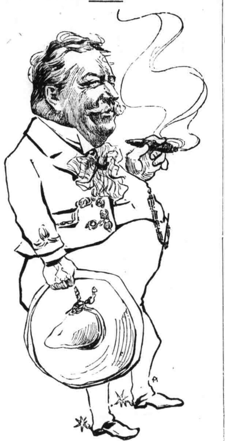
One of the staff artists of El Heraldo of the City of Mexico has produced the above suggestion regarding a feature of the wardrobe for the use of President Taft when he crosses the international boundary line to be the guest of the Mexican republic and President Diaz.