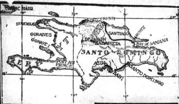
MAP SHOWING DISTURBED DISTRICT