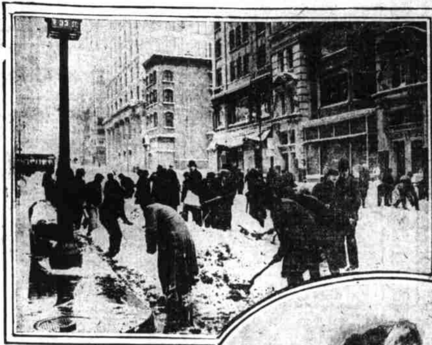
CLEARING AWAY SNOW AT FIFTH AVENUE AND THIRTY-THIRD STREET.