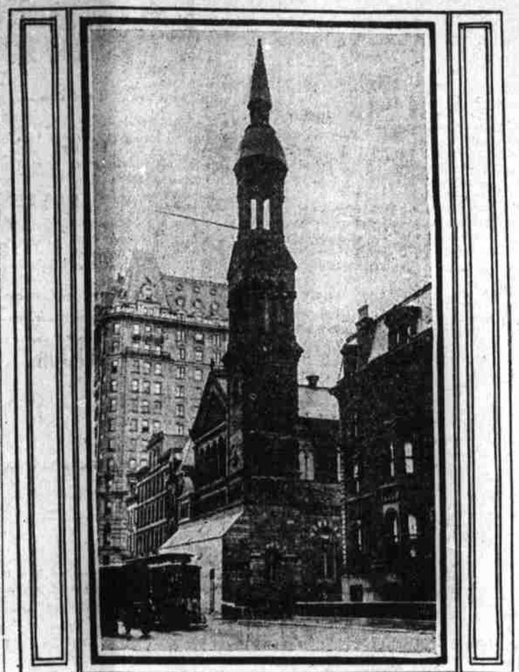
ST. BARTHOLOMEW'S CHURCH, MADISON AVE. & 44th ST.