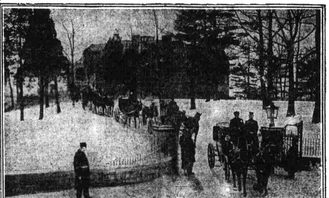
FUNERAL PROCESSION LEAVING MRS. EDDY'S HOME