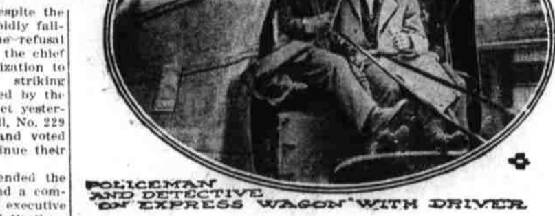
POLICEMAN AND DETECTIVE IN EXPRESS WAGON WITH DRIVER.