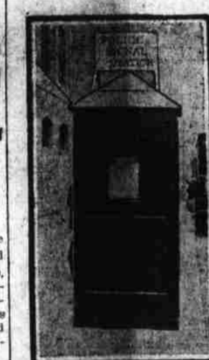
NEW SIGNAL POLICE BOX IN FRONT OF EXPRESS COMPANY'S BUILDING IN MADISON AVENUE.