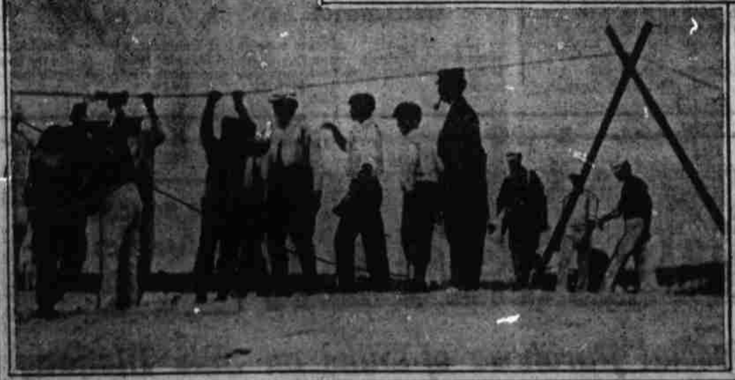
RESCUED SEAMAN BEING TAKEN FROM BREECHES BUOY BY LIFE SAVERS.

New York, Sept. 4.—The tug and south and west of Shinnecock life saving station. The vessel was piloted by the Atlantic coast, the tug Carrie A. Lane, a four masted lumber drower, bound from Station, Miss. Her crew of two to Boston with railroad ties, a mile