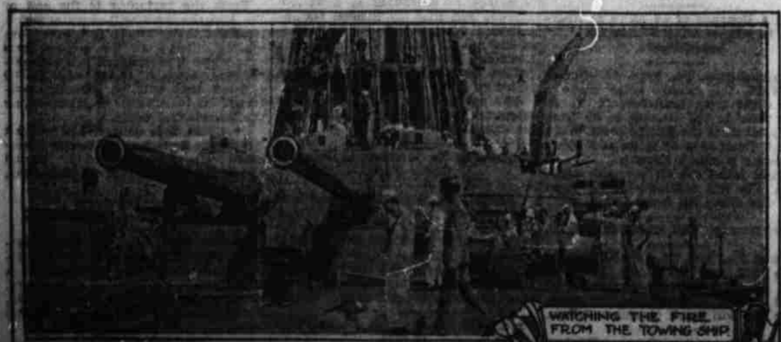
SWITCHING THE FIRE FROM THE TOWING SHIP.

The above photograph was taken off the Southern drill grounds, where the Atlantic battle ship fleet is at present engaged in elaborate naval maneuvers.