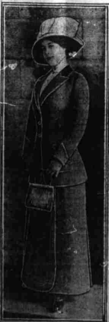
Gray mixture tailor costumes with veils, etc.

Soda crackers are extremely sensitive to moisture.