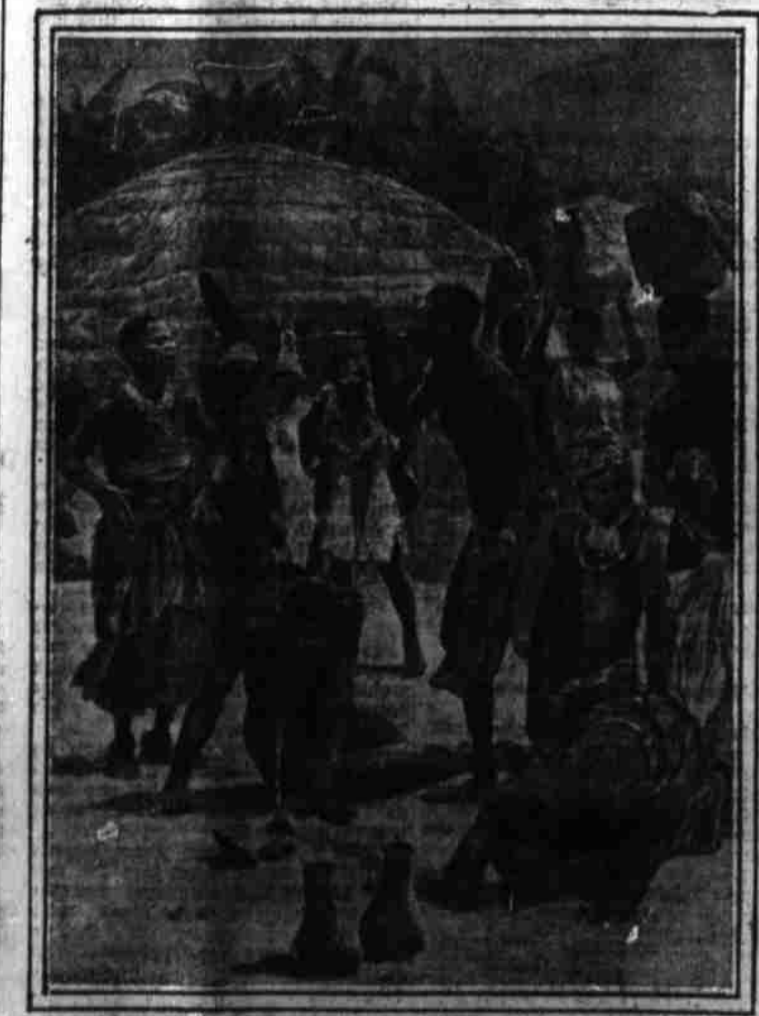
KAFFIRS SMOKING OPIUM THROUGH AN UNDERGROUND TUBE.

Kaffirs who have a craving for the curse of the East adopt a curious method of smoking their opium. Having made a hole in the ground, they insert in it a bottle with its neck and its bottom knocked off. The neck part of the bottle is left above ground, the lower part is buried. In the space between the end of the bottle and the bottom of the hole are placed, first live coals and then opium. A tube connects the bowl of the pipe and the "mouth-piece," passing underground to emerge two yards from the bowl. The kaffir draws at this curious pipe in turn.