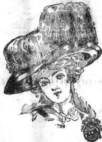
Surprising Values at $3.00

As exhibited here, will surely please you. You will like the styles, the qualities and the prices. All the new styles are here and you shouldn't wait another day before getting your new hat. We won't let you buy one that is not just right for you.